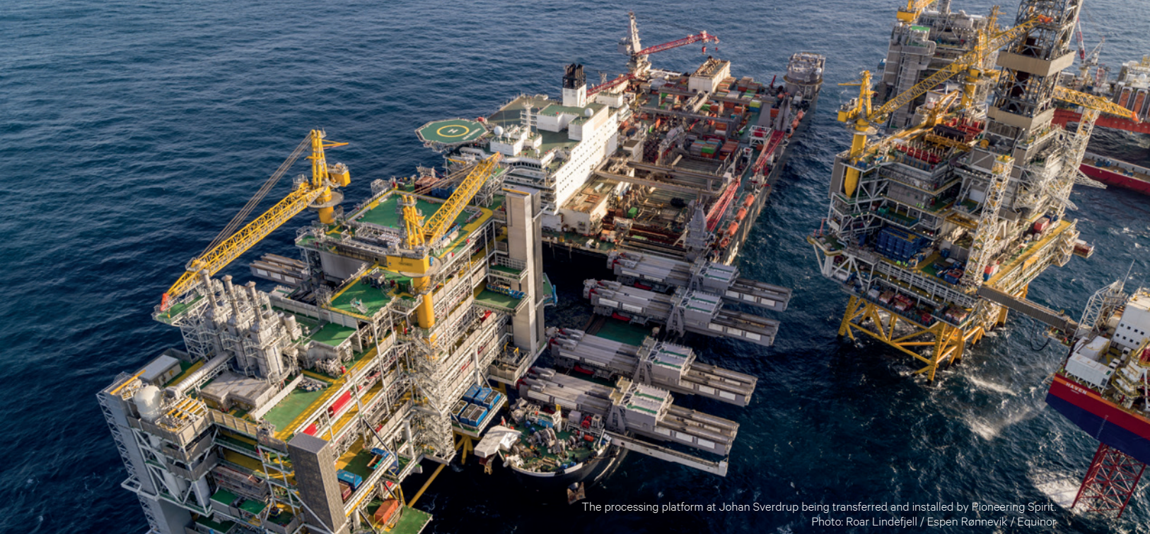
The processing platform at Johan Sverdrup being transferred and installed by Pioneering Spirit.